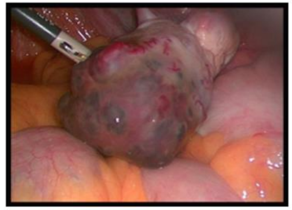
Figure 1 : Hypervascularised right ovarian tumour mass