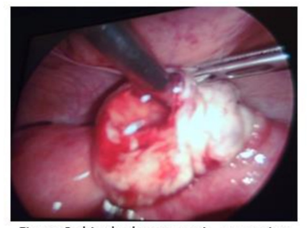
Figure 6 : bipolar haemostasis, respecting the ovarian parenchyma