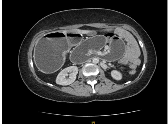
Figure 1: CT Scan imaging showing situs inversus (note liver on the left and stomach on the right side) with stomach and duodenum dilation.

H.E-H and Kh.R and M.S were responsible for the surgical intervention. Kh.R conceived and written the case report.