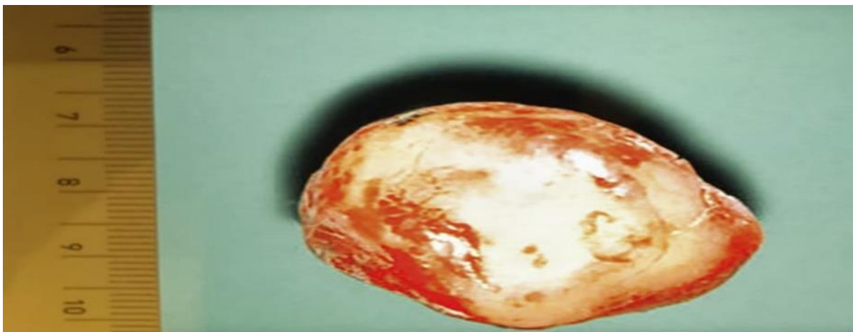
Figure 1 showing the radical excision of the hydatid cyst

There was uneventful in-patient recovery stage. She was discharged in good general condition. In her follow up, her wound healed without complications. Histopathological examination confirmed the diagnosis of hydatid cyst of the breast.