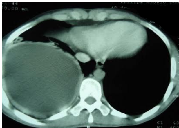
Figure 2: Chest CT scan A large round right basal pulmonary image

The chest CT scan showed a round pulmonary image, right basal and water tone of 18cm long axis (Figure 2).