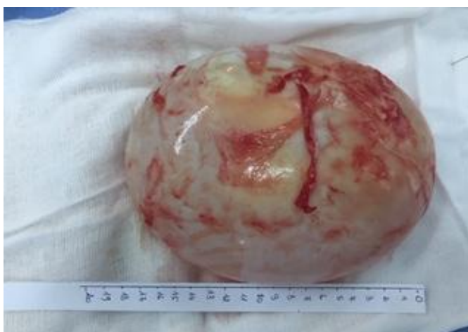
Figure 3: Enucleation of the cyst (postoperative appearance)

Abdominal ultrasound and echocardiography did not show abdominal or pericardial location. Hydatid serology was positive. The patient was operated on under general anesthesia with selective intubation to avoid intraoperative flooding of the contralateral lung. The patient was surgically approached by a right posterolateral thoracotomy passing through the 5th right intercostal space. After total liberation of the lung from cystopleural adhesions, surgical exploration revealed a large right lower lobar pulmonary cystic mass with pleural development. We proceeded to enucleating the cyst (Figure 3). The operating technique consists after incision of the pericyst in delivery of the cyst using a blunt instrument inserted between the cyst and the pericyst or pulmonary insufflation maneuvers performed on request by the anesthetist.